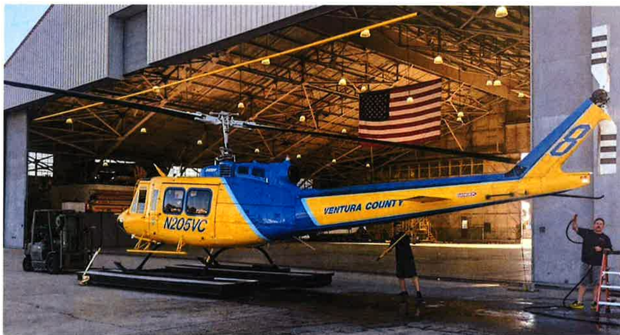
Ventura County Copter 8.