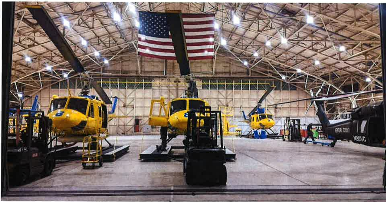
Ventura County Copters 6, 8, 9, and 2.