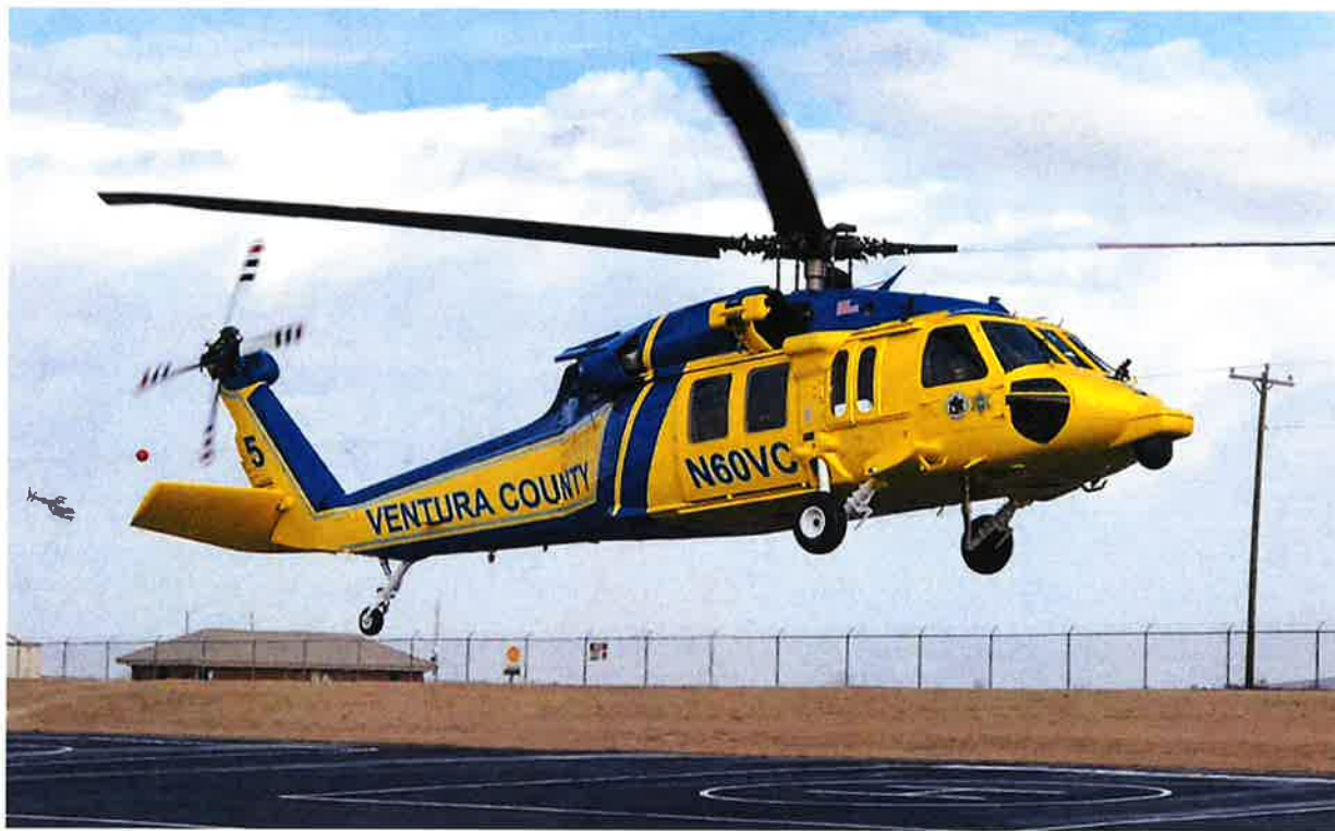
Ventura County Copter 5. Ventura County is converting military HH-60L Blackhawks into FIREHAWKS. January, 2019

personnel transport, search and rescue, law enforcement, and medical evacuation.