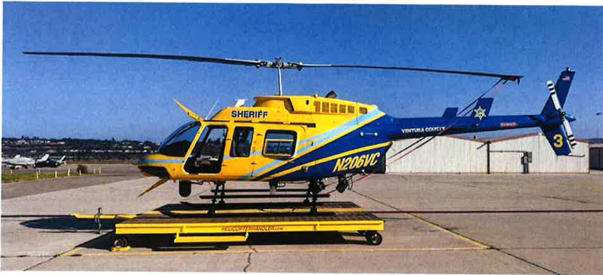
Ventura County Copter 3.