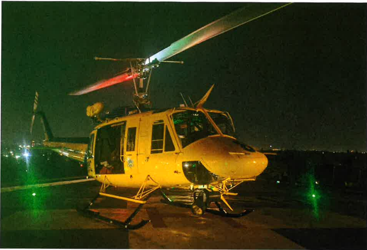
Ventura County Copter 8.