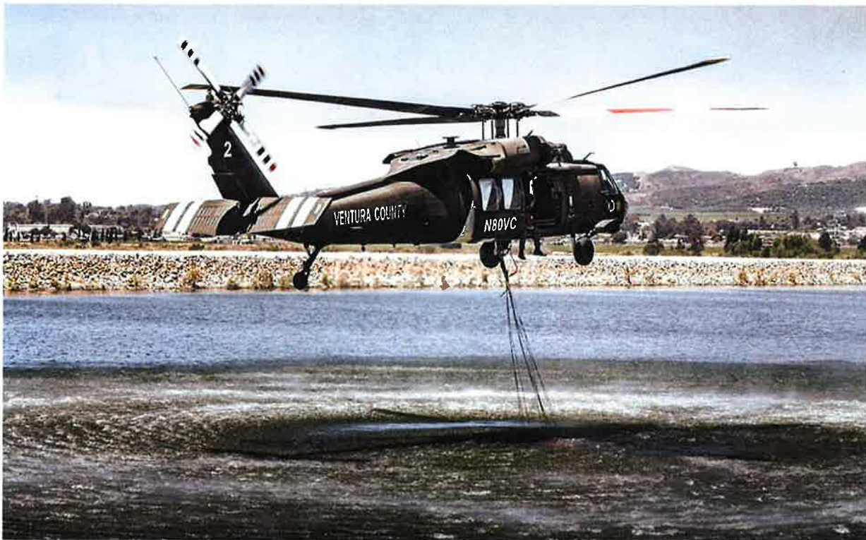
The first time that Ventura County Copter 2 was used on a wildfire, June 10, 2020.

Blackhawk, California, Long Ranger, UH-1, Ventura County